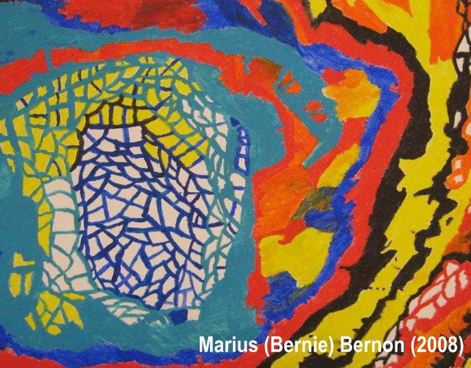
Marius (Bernie) Bernon (2008)